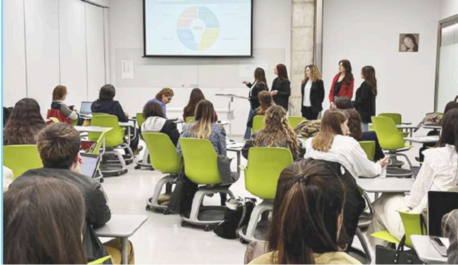
Imatge 2. Presentation of the project for primary school students.