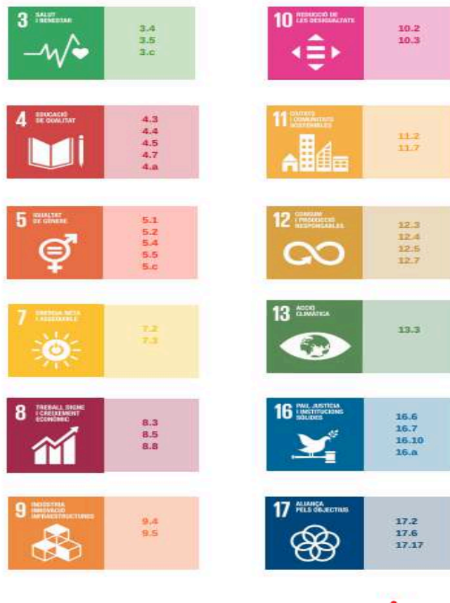
Figura 2. ODS i metes de referència per a UIC Barcelona.